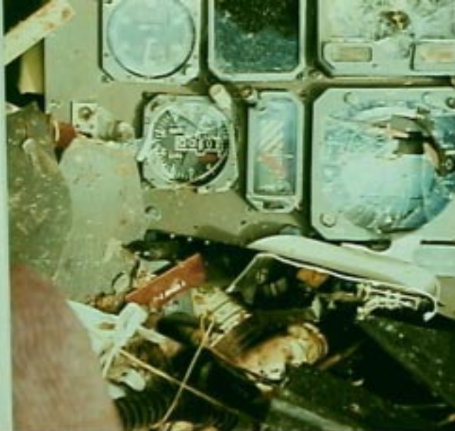
Photo 10: Close-up of First Officer's Instrument Panel (as viewed at scene)