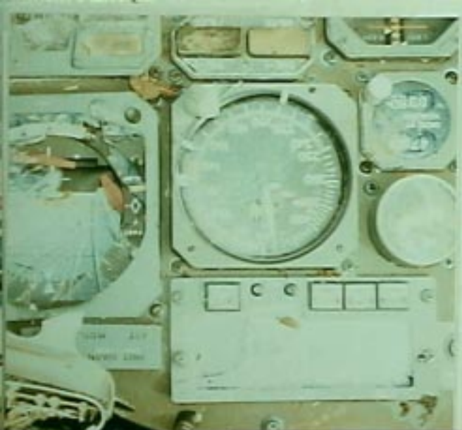
Photo 11: Close-up of First Officer's Instrument Panel (as viewed at scene)