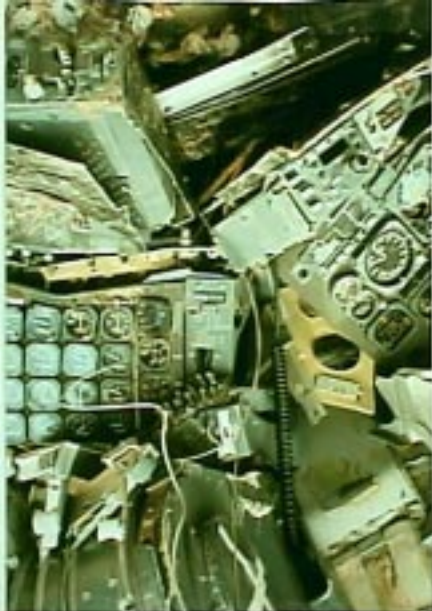
Photo 12: F/O Instr Panel, Portion of Auto Flt Control Panel, Center Instr Panel